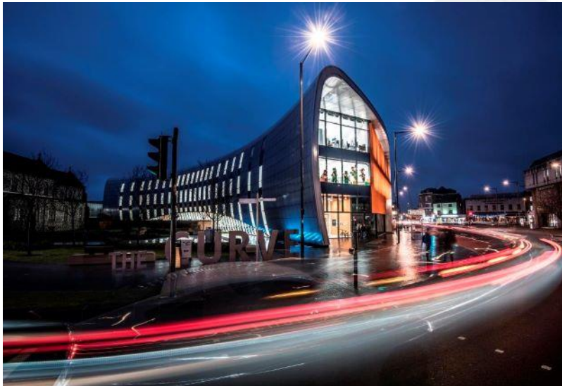
The Curve Slough's iconic library and cultural centre

Educational attainment in Slough is good, but the borough has pockets of deprivation and demands on children's and adults social services are growing in scale and complexity. Some families remain under pressure and the area has high rates of preventable ill health amongst both children and adults. Compared to local authorities in Berkshire and the average for England, Slough has the highest proportion of residents claiming Universal Credit and Housing Benefits. Slough remains the most relatively deprived area within Berkshire, followed by Reading. We are determined to develop services that are customer-oriented, focussed on early intervention, prevention, and evidence-based decision making.