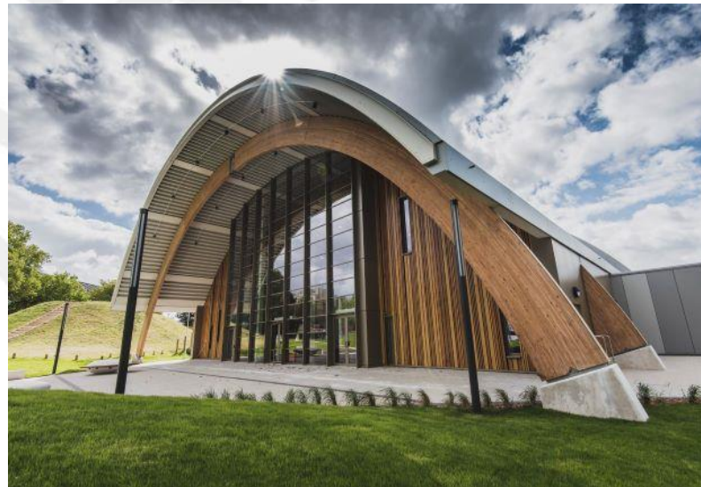
The Slough Ice Arena As well as the ice, there's also a well-equipped gym, alongside a climbing wall, dedicated Clip 'n' Climb wall and a café.