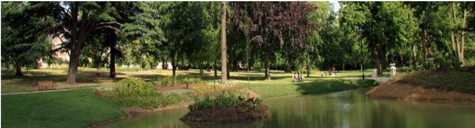
Herschel Park or Upton Park as it was originally called is Slough's oldest park

The council should regularly report progress on performance indicators (KPIs) against its Corporate Plan targets to Cabinet. Unfortunately, during 2022/23 this did not happen.