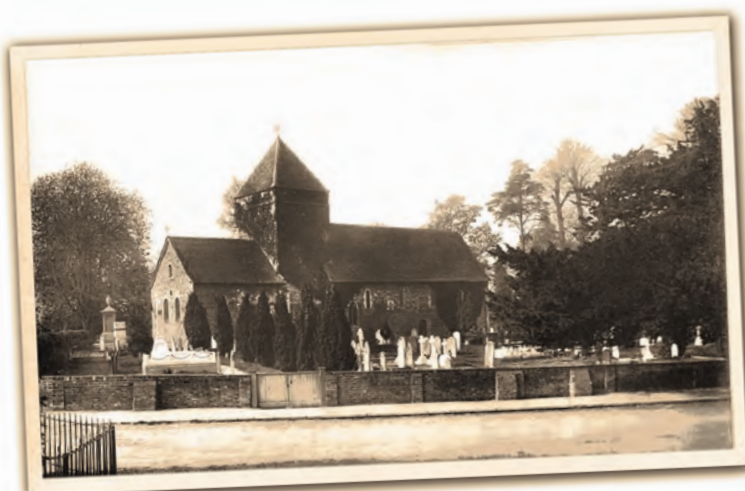
Church of St Laurence, Upton-cum-Chalvey c.1920

To access the church please refer to their website www.saint-laurence.com