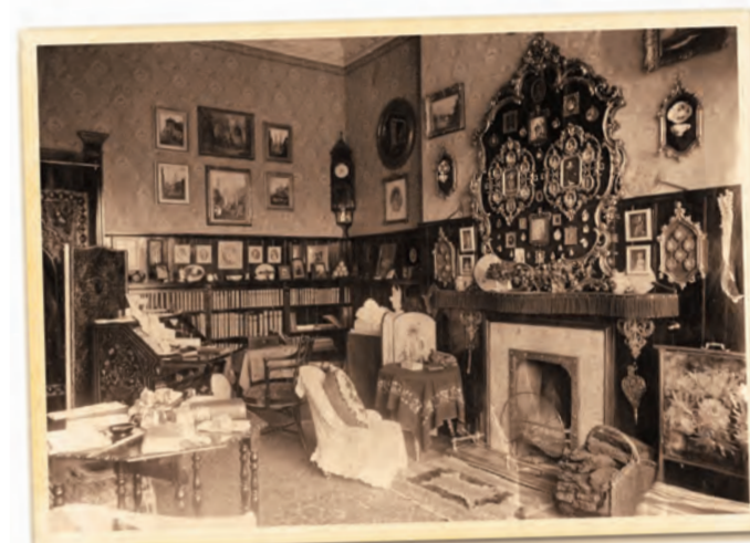
Interior of the Parlour of 2 East Villas, Upton Park c.1875