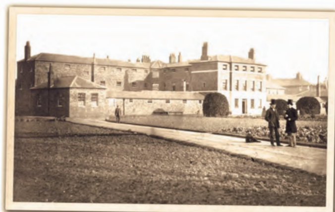
Eton Union Workhouse (now Upton Hospital) c.1880

The Eton Union Workhouse was known popularly as Albert House. In the 1930s, it was known as the Slough Public Assistance Institution and was run by Buckinghamshire County Council. In July 1948, it ceased to be a workhouse and was named Upton Hospital.