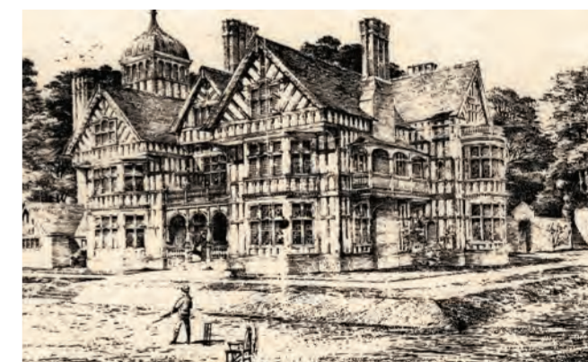
Architects Drawing of 'The Mere' c.1886

The Bentley Education Centre is housed in 'The Mere's' motor-carriage house. This is now believed to be the third oldest motor-carriage house in the country.