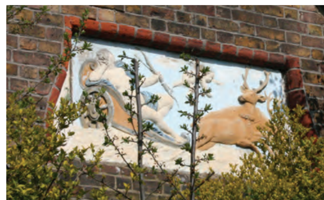
Frieze depicting the Goddess Diana on Diana Lodge

gold braid. From the 1870s, until c.1930, the lodge also housed the Upton Park Billiard Club and Reading Room. The Lodge is now divided in two.