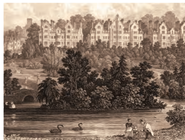
Engraving of Victoria Terrace c. 1843

During the 1990s, the houses were divided into a number of flats and a new row of houses and flats, fronting onto the park, was built and became known as Bulstrode Place.