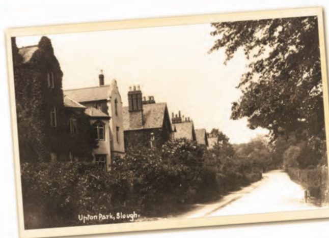
West Villas c.1912

West Villas was part of the original layout of the Upton Park Estate. This included a carriage drive between the villas and the park, which was common practice in mid-Victorian parks. The villas towards the end of the drive are part of the original architectural scheme, while the more central villas were rebuilt in the 1990s. As you walk down West Villas, look out for the rather beautiful Arts and Crafts terracotta plaque dated 1885.