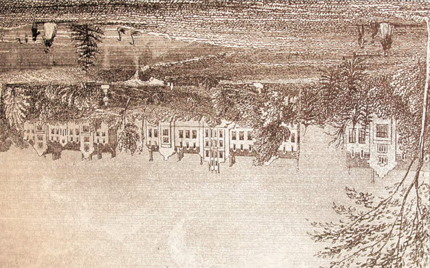
Engraving of Upton Park c.1860