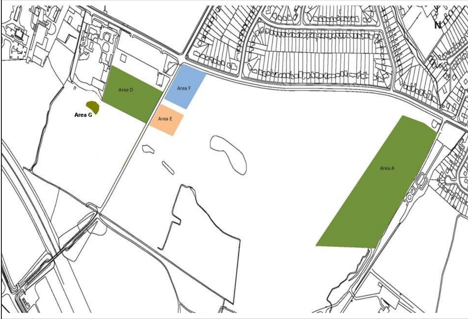
Figure 1 Areas A, D, E, F and G

The boundary of the site that this Remediation Statement relates to is the same as the areas Determined as Contaminated Land under the EPA 1990 Section 78B, which are shaded green, blue and orange in Figure 1 below.